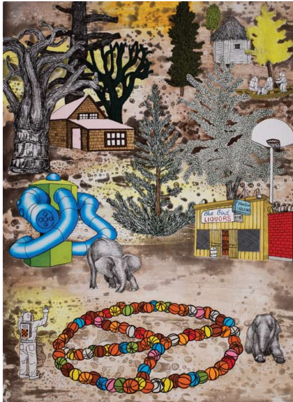
(left) Ouroboros, 2007 Color aquatint, spitbite, sugarlift and softground etching w/blacklight sensitive areas. 46 1/2" x 36"; Edition of 35

work is the real energy. He is just a fallible person who's gone. But his studio is still there. Now you have to take your shoes off to enter. It's like it's a sacred space. But it's a culturally sacred situation rather than sacred like nature.